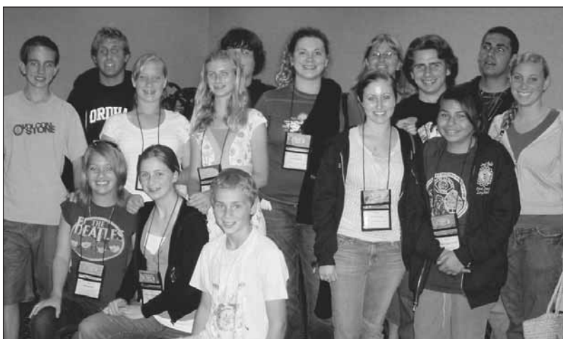
Beloved Bells youth from First Congregational in Long Beach performed at Synod in the City