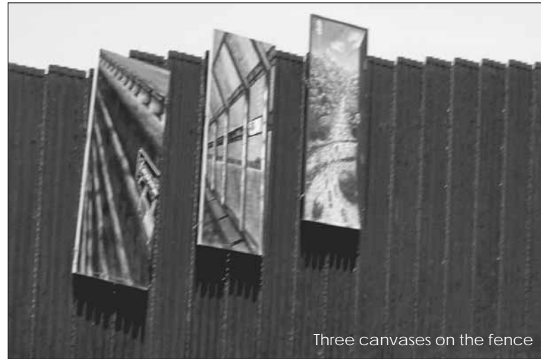
Three canvases on the fence

About 75 people made the trip across the border as a pre-event to the Conference Annual Gathering on May 31. Several San Diego university students who work with groups in Tijuana and some members from the UCC Justice and Witness Ministries were resource persons on the informative border experience.