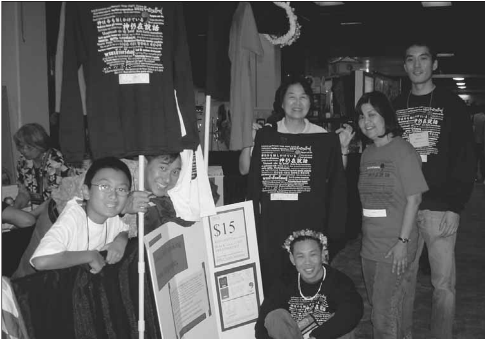
PAAM and Montebello Plymouth youth and adults with Mitchell's t-shirts at Synod